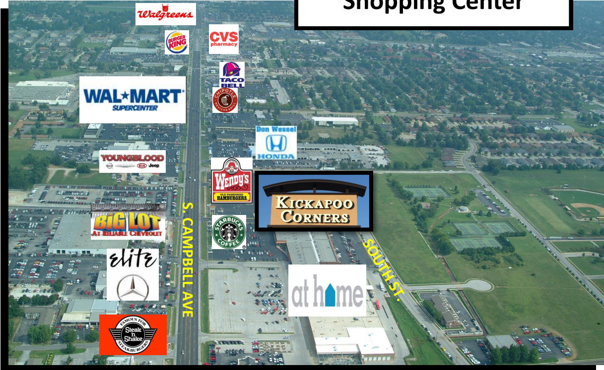
Kickapoo Corners View to the North